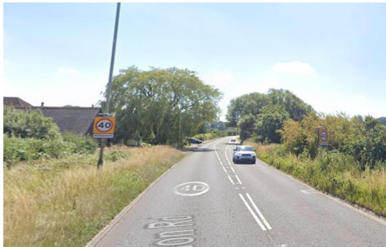
From the direction of Chippenham

There are, however, two existing village “gateways” on the A4, coinciding with the 40mph terminal points, and with existing “Pewsham” signage. These are located at Forest Gate (from the direction of Chippenham) and immediately prior to the A342 junction (from the direction of Calne).