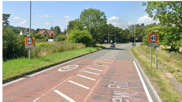
From the direction of Calne

It would make sense to reinforce these two existing settlement “gateways” with white gates to reinforce the reduction in speed limit through Pewsham.