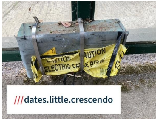
Studley Crossroads (Calne-bound)

Electrical boxes taped up and awaiting repair: