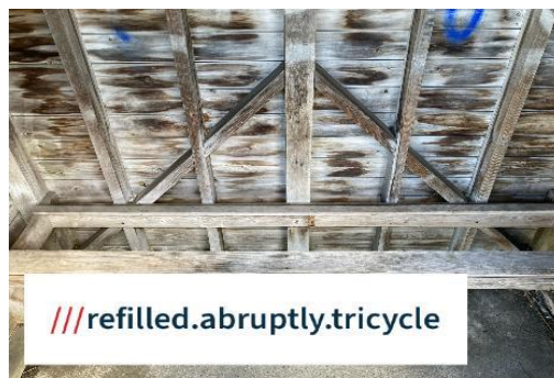
A4 London Road – southbound