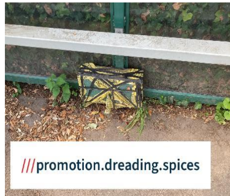
Church Road (westbound)

Missing or broken benches at the bus stops at the A4 Pewsham Garage stops: