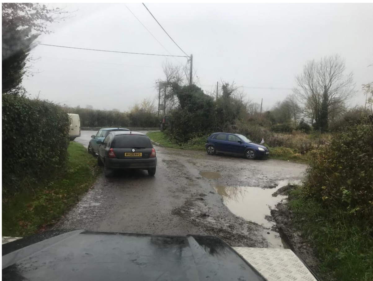
Example of the parking referred to in the request.